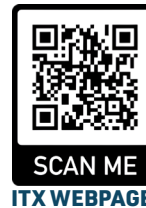
SCAN ME ITX WEBPAGE