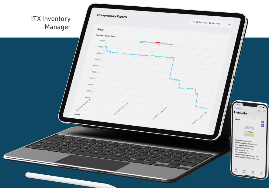
ITX Inventory Manager